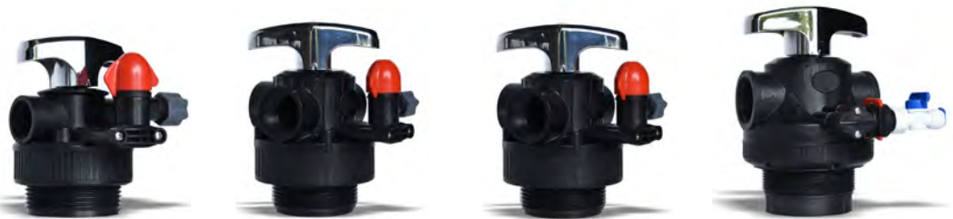
Manual Soften Valve