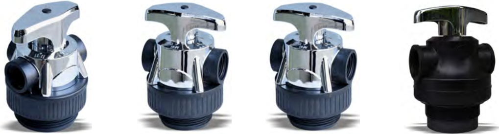
Manual Filter Valve